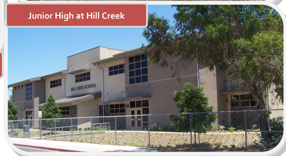
Junior High at Hill Creek