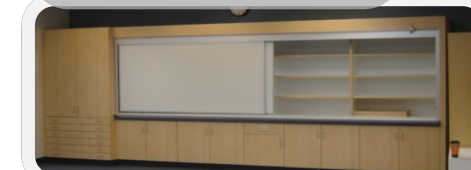
New Teaching Wall/Cabinets in Every Classroom