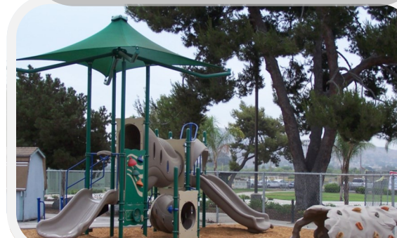
New Play Structure at All Sites