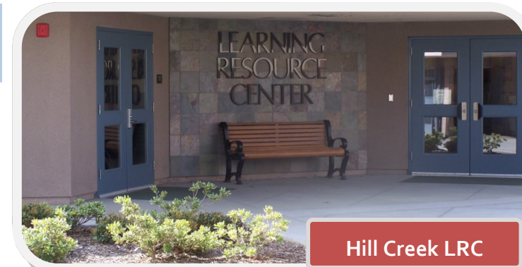
Hill Creek LRC

July: ICOC Fourth Annual Report Issued to the Board