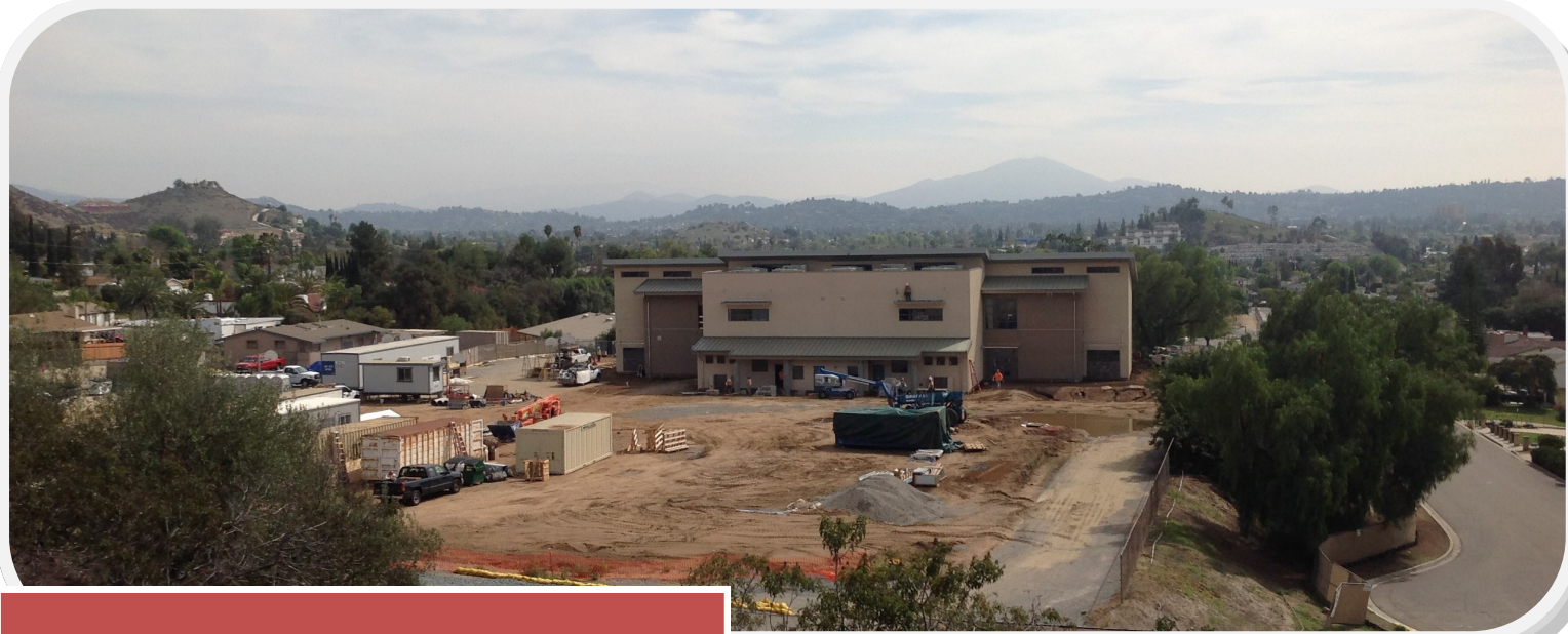
Pepper Drive Construction Progress, March 2014

"In order to construct, acquire, renovate, and upgrade school facilities and provide major repairs and upgrades of existing school facilities at schools of the Santee School District, and in so doing, increase safety and educational effectiveness of classrooms for students, shall the Santee School District be authorized to issue Bonds in an amount not to exceed $60,000,000."