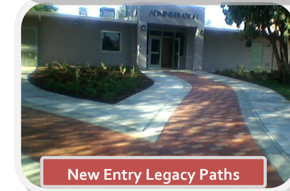
New Entry Legacy Paths