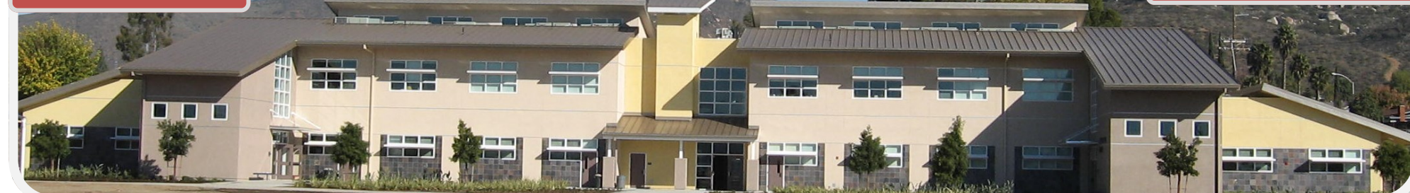
Cajon Park Addition