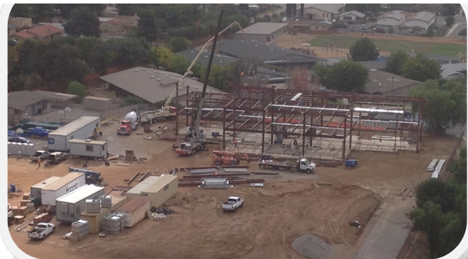
Pepper Drive Progress, November 2013